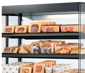
Food (literally) in the spotlights - LED lighting above each shelf.