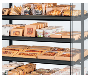
Ultimate product visibility - transparent design, thin shelves, no distraction.